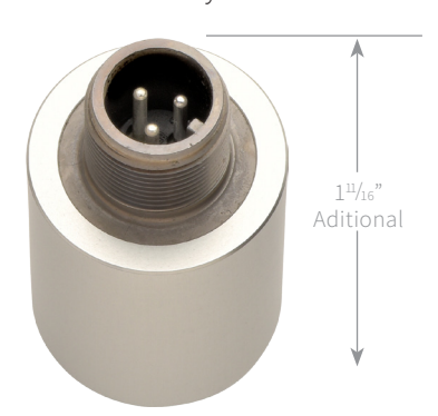
"M" Interface P117, J705, J205, P605 "F" Set Only Except "C" "K" and "F" Set on P605

This interface is rated as environmentally resisting. It is intended for use where the connector will be subjected to heavy condensation and rapid changes in environmental temperature or pressure. This connector is equivalent to MS3102E-10SL-3P. Applicable to models shown below only.