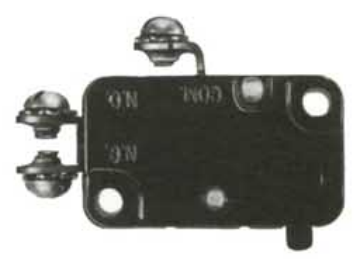
TS Screw Terminal UL Listed (except 25 amp) CSA Listed