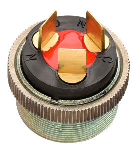
TB 3 standard 1/4" terminals accept arc-less (or equal) female quick connect terminals