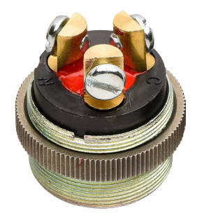
TS Three flat bar terminals with #6-32 pan head screws at right angle