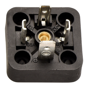
DIN Male Plug "F" Set Only Except "C", "K" & "F" Set on P605 Series Units