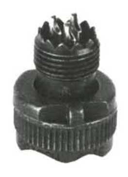
MS3106E Connectors – All Models With "M" Interface