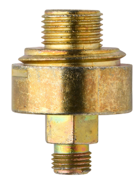
1/2-20 SAE Fitting with Optional O-Ring (Optional zinc diecast for P90) (Optional stainless steel for P95)