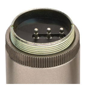
T Standard solder type terminals also accept AMP 60789-2 and 60598-4 Pin Receptacles

P100, P117, P119, J205, P605, J705 and W117